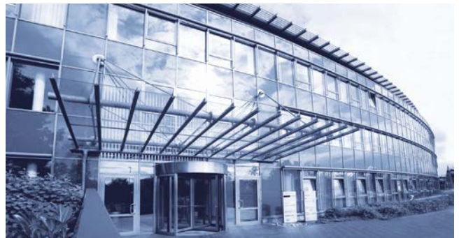
Basler AG Germany, Headquarters

Basler has 30 years of experience in computer vision. The company is home to approximately 500 employees at its headquarters in Ahrensburg, Germany, and its subsidiaries and sales offices in Europe, Asia and the USA.