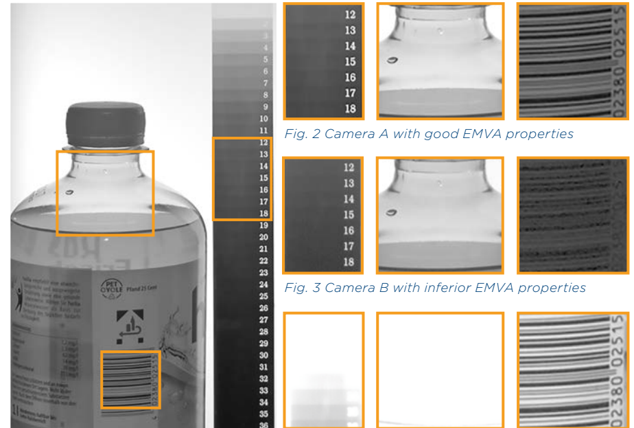
Fig. 1 Test Setup

The number of electrons a pixel can hold is limited and set by the saturation capacity. In a saturated pixel no more photons can be converted into electrons and thus image information is lost. In the example, the fill level of the bottle in fig. 4 is invisible as the saturation capacity of the camera is reached. At a shorter exposure time (fig. 3) the fill level is detectable but at the expense of the barcode visibility.